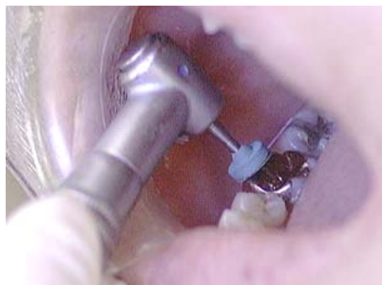
Photo 2 Oral collection process